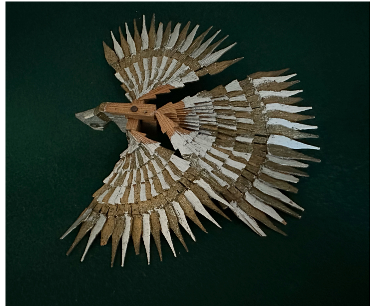
Bottom of bird

Artist unknown: Bird was purchased in a box of items from an auction sale.